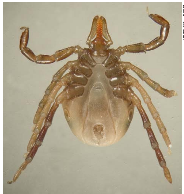
Semiengorged female paralysis tick. Only the sac-like body has increased in size—the hard shield remains the same size throughout feeding.